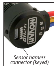
Sensor harness connector (keyed)

Note: If any of the teflon wires pull out of the motor sensor harness connector, refer to the SENSOR HARNESS WIRING section on back.