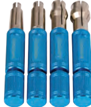
MK-BRT05 Bearing Remover M5 MK-BRT06 Bearing Remover M6 MK-BRT08 Bearing Remover M8 MK-BRT10 Bearing Remover M10

MuchMore's New Bearing Remover is a tool that can remove your ball bearing from Kyosho Mini-z, steering arms, steering posts, hubs etc. easily and safely. Simply insert this Bearing Remover into the bearing then tighten the hand screw and pull it out.