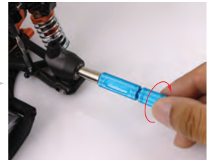
3. Tighten the handscrew (CW).