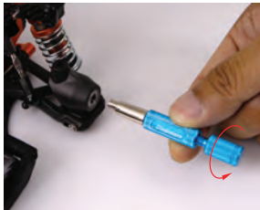
1. Unscrew (CCW) the handscrew.