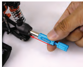
2. Insert the Bearing Remover into the bearing.