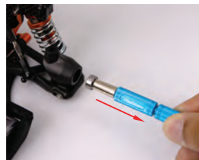
4. Pull out the Bearing Remover.