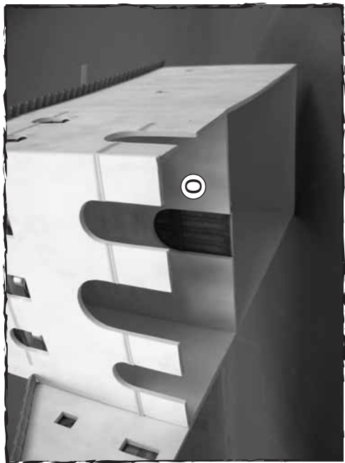
Mission San Luis Obispo de Tolosa